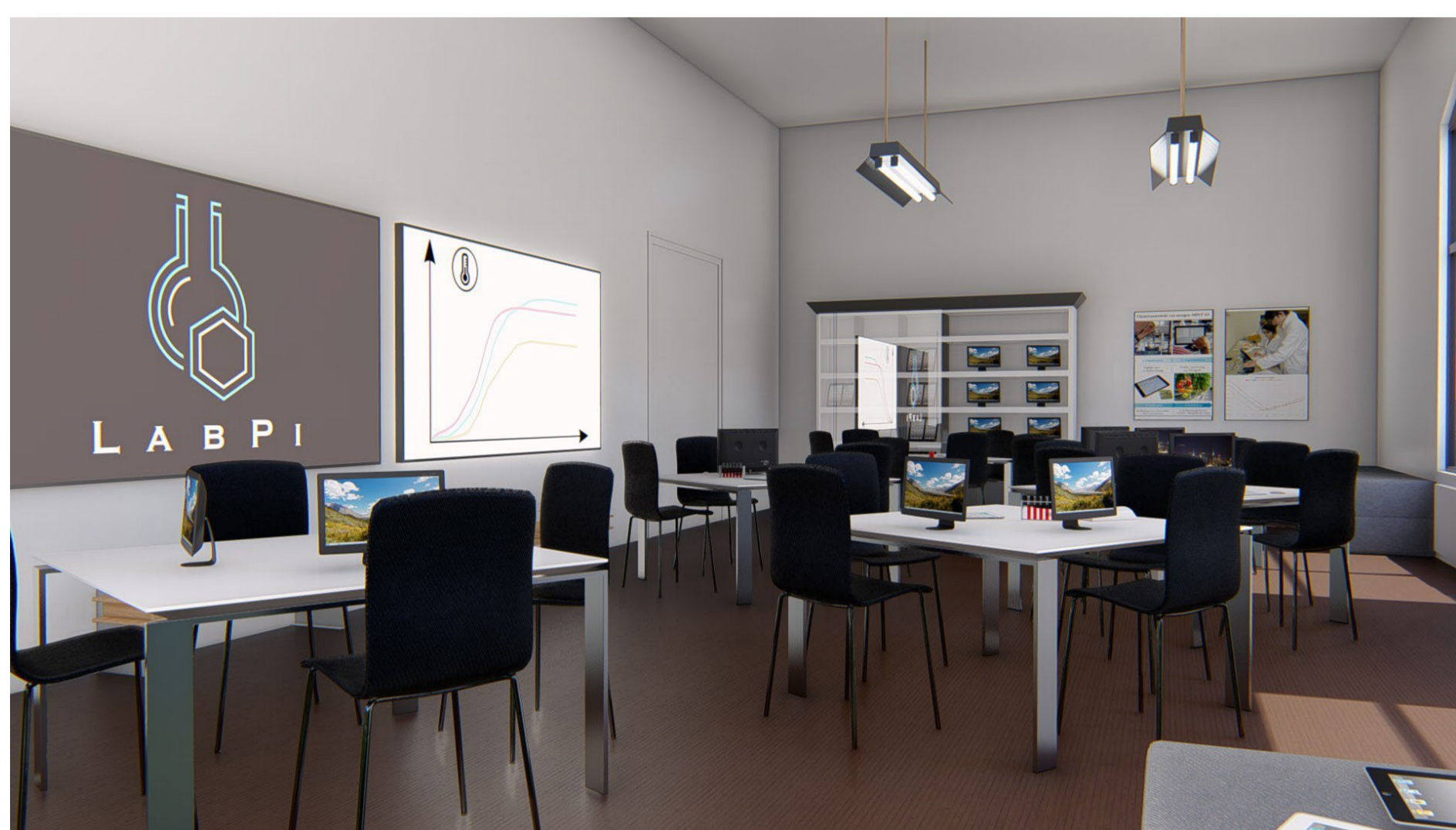
Fig. 1 : Model sketch of the planned digital student laboratory

Digital media have long since arrived in didactic chemistry research. This research is often linked to the goal of improving the classroom experience and the students' understanding of chemical content, even leading to a transformation of the teaching and learning culture. If this succeeds, new media can contribute to the individualization of learning and to the much-demanded differentiation in heterogeneous learning groups [1]. At the Friedrich Schiller University Jena, a student laboratory is being established that uses and researches the potential of digital media for teaching and learning and promotes the improvement and transformation of current learning settings. With this laboratory, digital media can be used to make the student lab day as interesting as possible and to tailor it closely to the learner's needs. The concept of the digitalchemlab, the planned pilot learning module and the associated research project will be presented in the following.