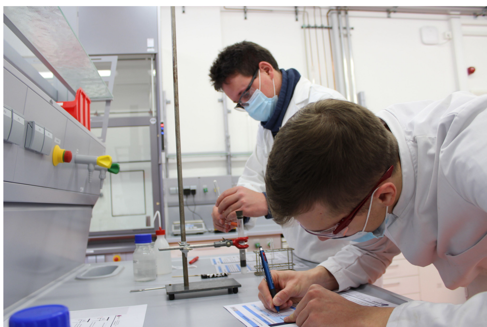
Fig. 3: Students conducting experiments on household cleaners

The example module will be tested with three to four school classes and is planned for the summer of 2022. One school class will serve as a control group that will carry out the learning module without the digital elements and tools but with the same tasks, all analogue. The research project is supported and accompanied by the department for educational psychology [6]. The aim is to investigate the knowledge gain, the use of the offer as well as the motivational orientation of the participants. Both qualitative and quantitative research methods will be used. First results should provide indications for improving the offer, which will then be tested and evaluated in a main study.